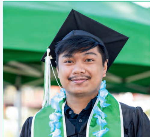
EVC GRAD 2024