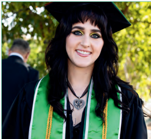
EVC GRAD 2024