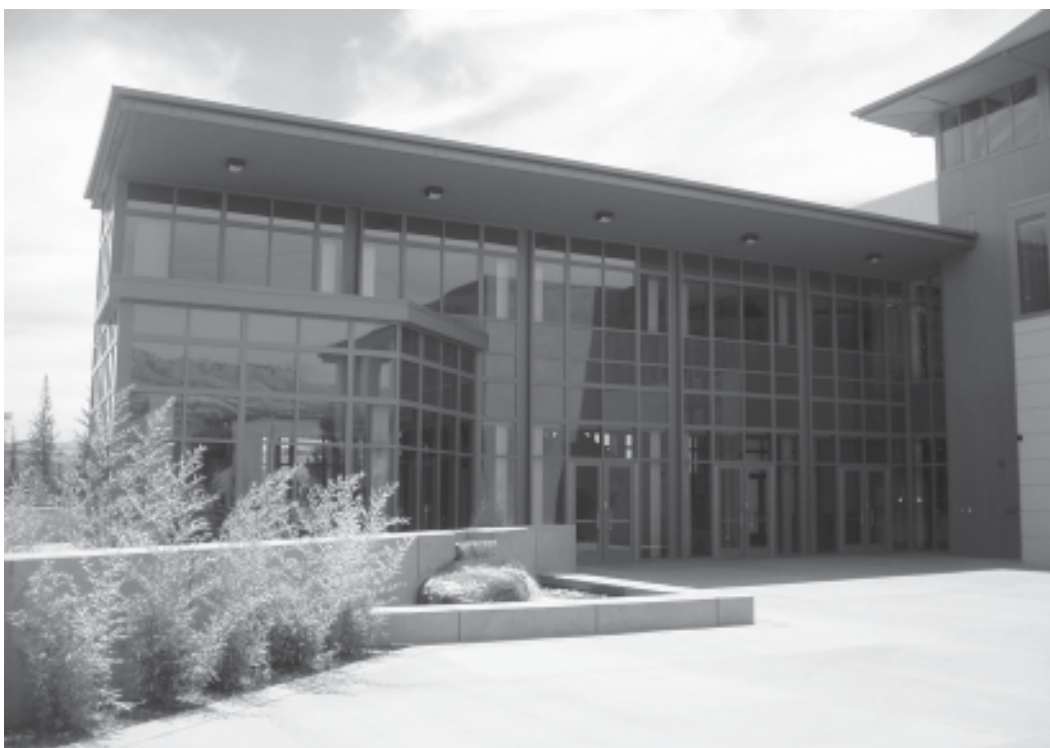
The new Library/Educational Technology Center, also shown on pg. 1

The San Jose/Evergreen Community College District is a participant and sponsor of the South Bay Regional Public Safety Training Consortium. This Consortium is a joint powers agency created by local community colleges to present certified courses associated with public safety. These include Law Enforcement, Reserves, Corrections, Probation, Fire Technology, Emergency Medical Services, Hazardous Materials, and Dispatch. The intent is to enhance the campus-based degree and certificate programs, giving students the option to go directly into Academy-type skill development training presented through the Central Consortium. Telephone (408) 270-6458.